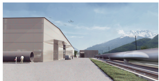
Planned AlphaTube Infrastructure, Collombey-Muraz, Switzerland